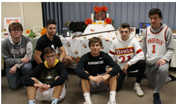
Pictured are View of Spain students in front of the ofrenda they created for deceased rapper, The Notorious B.I.G.

Students taking View of Spain at the high school did a project for Day of the Dead. They researched what Day of the Dead is, what an ofrenda (altar) for Day of the Dead