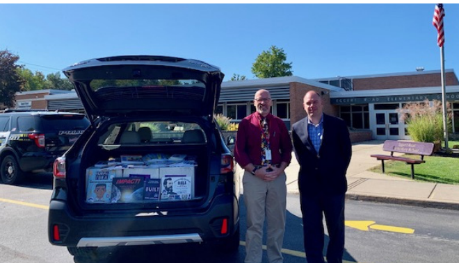
This August, through the Subaru Loves Learning initiative, Subaru partnered with the American Association for the Advancement of Science (AAAS) to donate award-winning science books to students at Eggert Elementary.