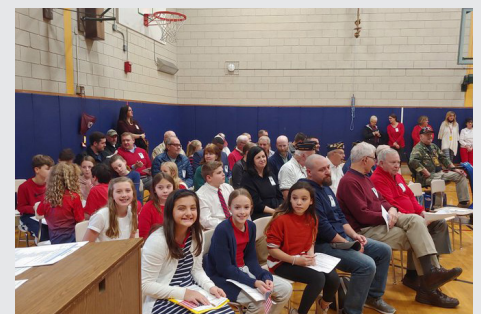
South Davis students are seated with the veterans being recognized at the South Davis Veterans Day assembly.