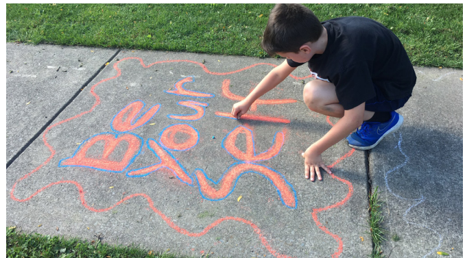
Kindness in Chalk Week (10/7-10/11) students are encouraged to spread kindness by writing words of encouragement on the sidewalks of their schools and communities. The slogan for the week is "One sidewalk, one message, one million smiles."