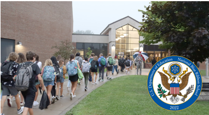
Orchard Park High School has been recognized as a 2022 National Blue Ribbon School.

Orchard Park High School is recognized again in its first year of eligibility since receiving this award in 2016 and is one of only three schools in NYS to be designated as a National Blue Ribbon School twice.