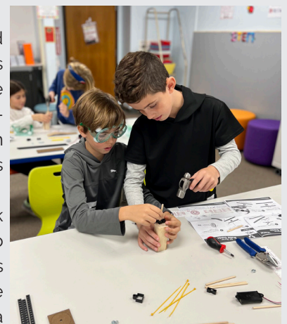
Fifth grade students are building their fan-powered air racers.