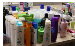
This fall, the FSC held a "Winter Gear Up" and a "Personal Care Drive," which were generously supported by faculty and staff at OPCSD.