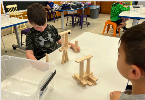
South Davis students tinker and build with KEVA blocks.

Students are already benefiting as they collaborate and problem-solve with their peers through hands-on learning experiences. Students in Kindergarten through second grade have been experimenting, testing and working through the engineering design process to create "sail cars." Students learned to adjust and improve their sail's shape, angle and pitch to gain speed and distance. Intermediate students in grades three through five built, tested and re-engineered fan-powered air racers. Equipped with an electric motor