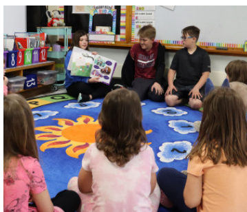
Pictured above are some of Windom Elementary's student leaders in action. Top photo: members of the Character & Service team are pictured participating in a Character Ed. assembly that the students helped plan. Bottom left photo: a member of the Hallway Greeting Team assists a younger student as they head to their classroom. Bottom right photo: Members of the Student Advisory team are pictured reading to a Kindergarten class.